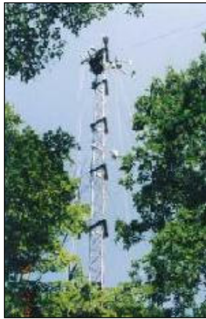
Figure 1: A Flux tower at Takayama site.